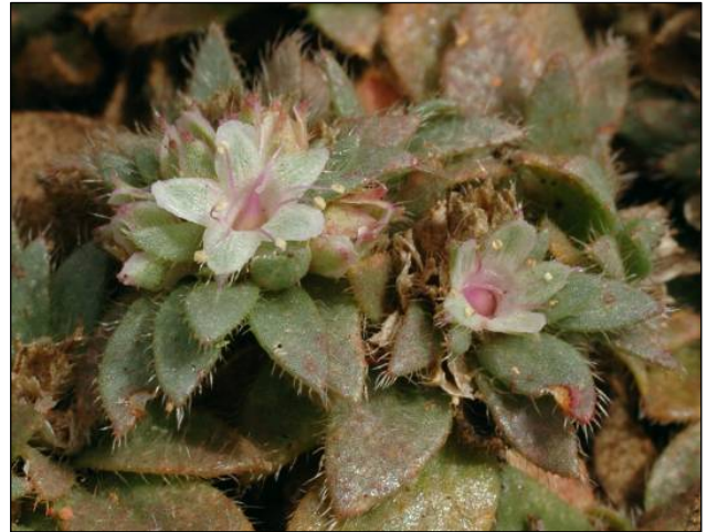
Pl. 3 Trianthema rhynchocalytra