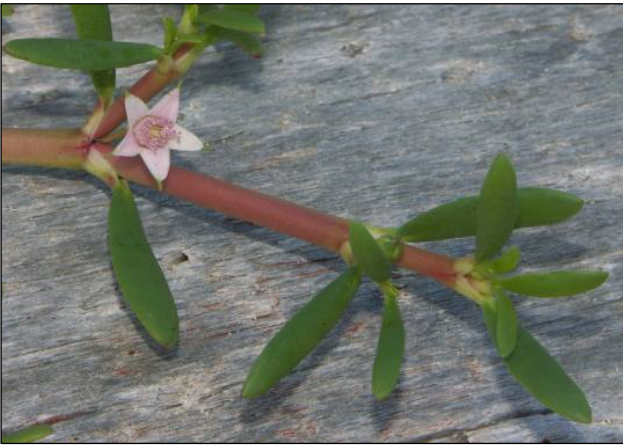
Pl. 1 Sesuvium portulacastrum