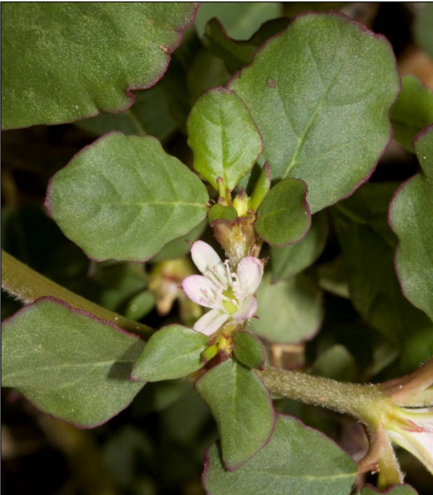
Pl. 2 Trianthema portulacastrum