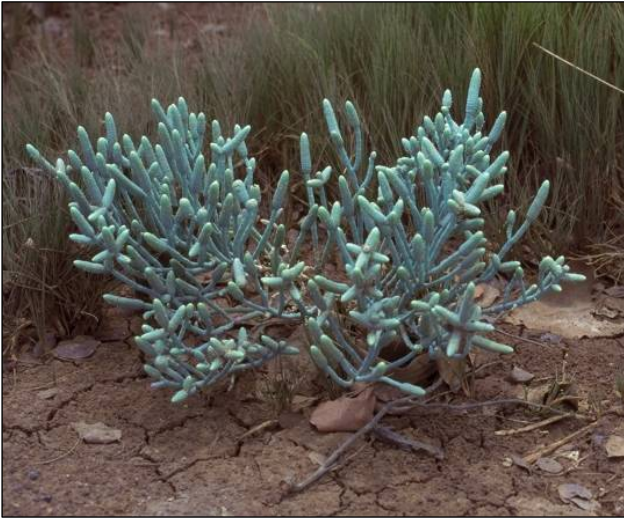
Pl. 3 Tecticornia australasica