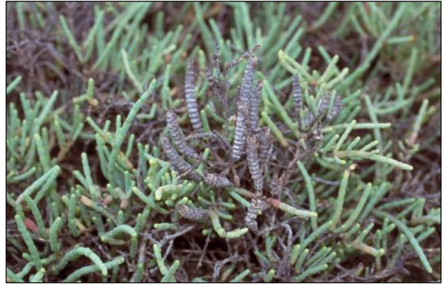
Pl. 5 Tecticornia indica subsp. julacea