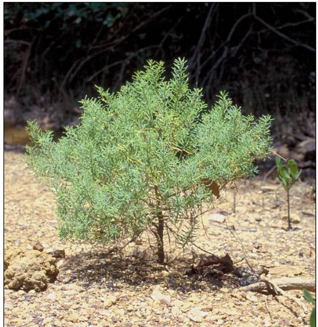
Pl. 2 Suaeda arbusculoides