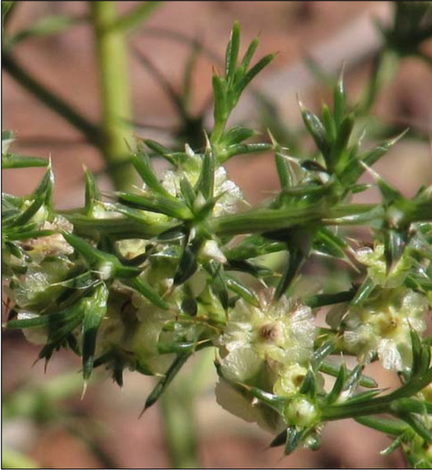
Pl. 1 Salsola australis