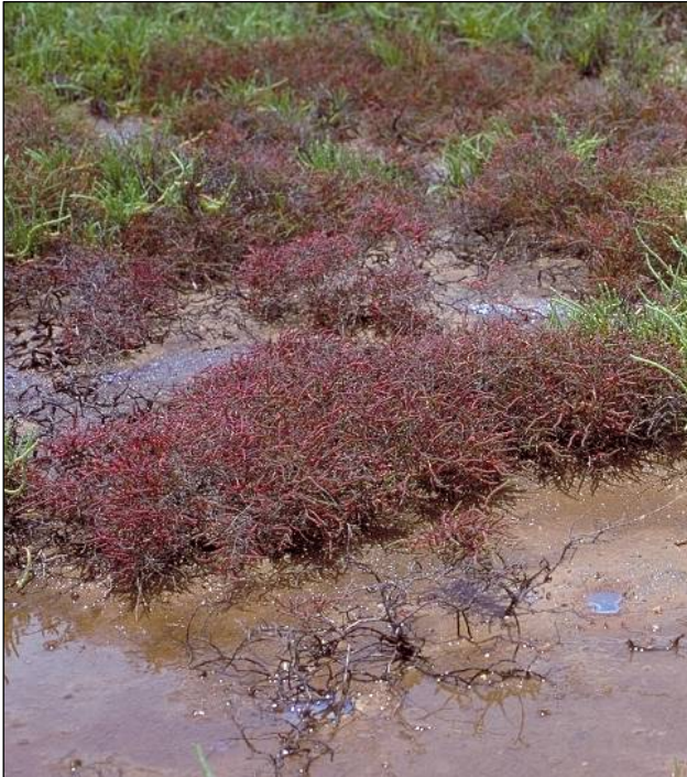
Pl. 4 Tecticornia halcnemoides subsp. tenuis